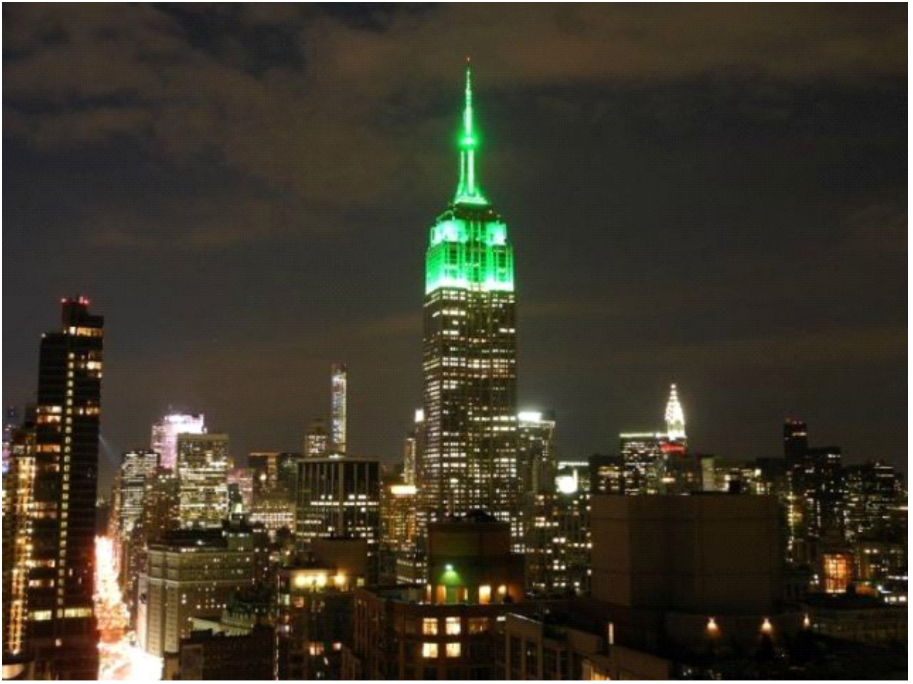
Empire State Building in NYC lit up in green for Eid al-Fitr

<u>Eid al-Fitr celebrations</u> on Friday around the world and to mark the holiday one of New York City's most iconic landmarks was lit in green.