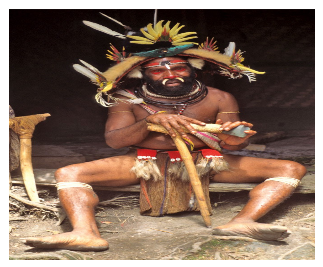
Part Six Powers of Darkness and Human Agents